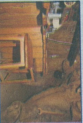
Snug: The interior bar seats 15

The tree is so wide it takes 40 adults with outstretched arms to encircle its 47metre (154ft) circumference.